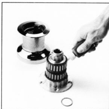
Lightly grease roller bearings.

Reassemble winch in reverse sequence to above. Check for correct operation.