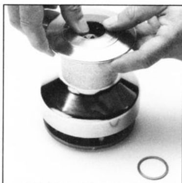
Lift off the drum.