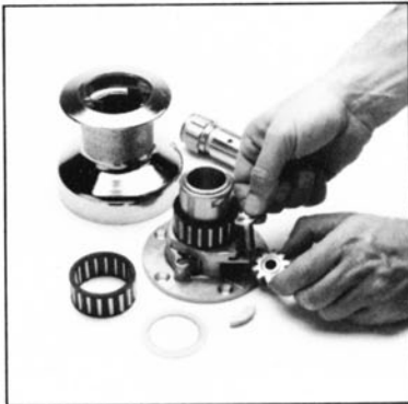
Remove gear, clean and lightly grease.