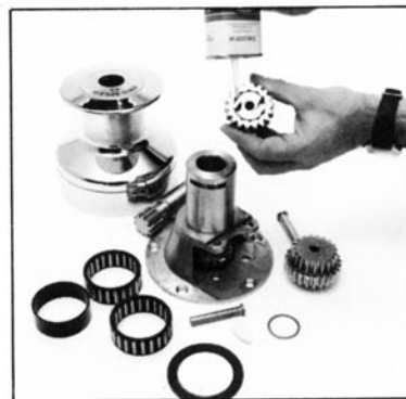
Remove pawl gears and clean. Lightly oil pawls and grease gears.