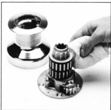
Wash centre stem, roller bearings and drum bore with kerosene (paraffin). Dry with a non-fluffy cloth.