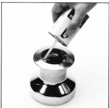
Lightly oil top pawls.