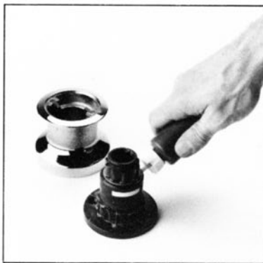
Lightly grease centre stem.