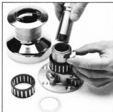
Remove centre spindle key and slide out spindle.