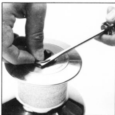
Remove the top circlip with a small screwdriver or knife blade.