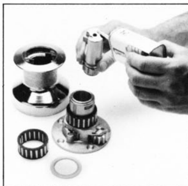
Clean spindle, grease lightly and oil pawls.