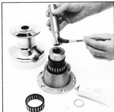
Clean and lightly grease spindle.