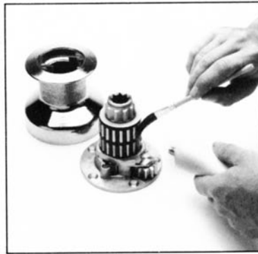
Reassemble spindle and gears. Lightly grease bearings. Oil pawls in winch base (16 only).

Reassemble winch in reverse sequence to above. Check for correct operation.